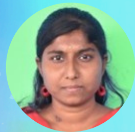
SREEMATHI D INTERNZ LEARN 7 LPA